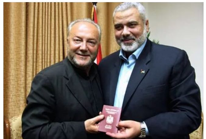
George Galloway receives a passport from Hamas Prime Minister Ismail Haniyeh

In 2009, Mr Galloway was reportedly described by one Hamas official as a "hero" and was awarded a passport by the Hamas Prime Minister, Ismail Haniyeh, in "deep appreciation" of his support.